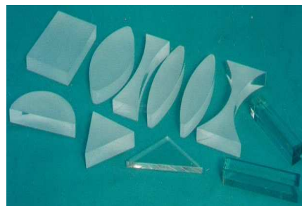
OPTICAL KIT PERSPEX LENS, SLAB, TRIANGLE