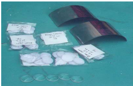
LENSES PLANO CONCAVE/ CONVEX