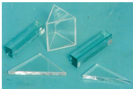
PERSPEX PRISM TRIANGLE