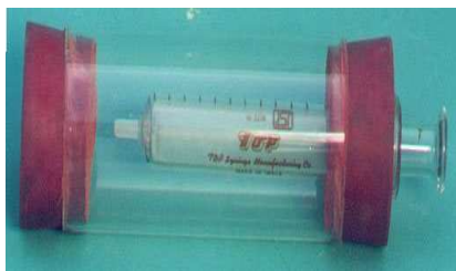
GLASS SYRINGE APPARATUS