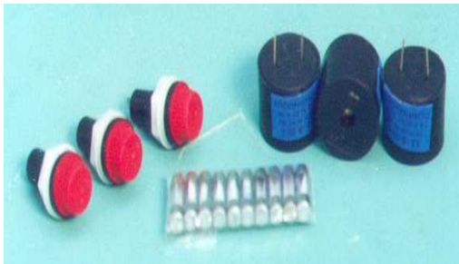
ELECTRICAL MATERIAL KIT