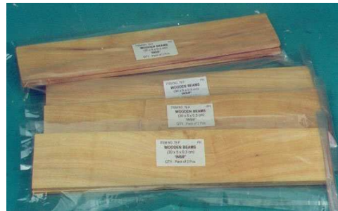
MATERIAL KIT BEAM